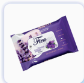
Refreshing Wipes 25 Pulls Lavender