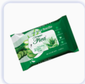
Refreshing Wipes 25 Pulls Aloe Vera & Cucumber