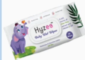
Baby Wipes 80 Pulls