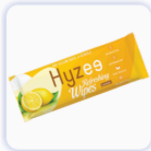
Single Refreshing Wipes Lemon