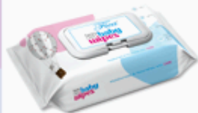
Baby Wipes 120 Pulls