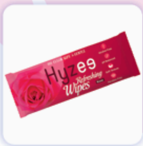
Single Refreshing Wipes Rose

Wet wipes have come a long way. There's a wet wipe for just about everything nowadays. And it's normal to see them just about everywhere: at home, at the grocery store, at the gym, at the office, at restaurants, in diaper bags, even in auto repair shops and garages.