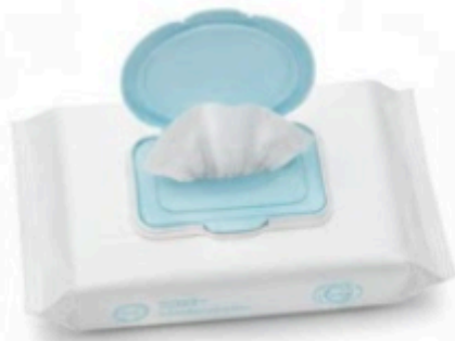
Baby Wipes (99% pure water)