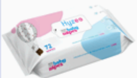
Baby Wipes Without Lid 72 Pulls