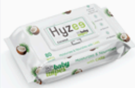
Coconut Baby Wipes 80 Pulls