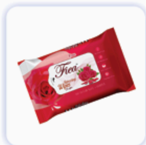
Refreshing Wipes 25 Pulls Rose