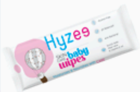
Baby Wipes Single