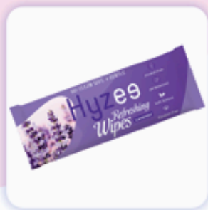
Single Refreshing Wipes Lavender