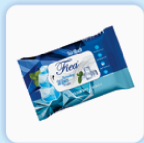
Refreshing Wipes 25 Pulls Ice Fresh