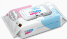
Baby Wipes 80 Pulls