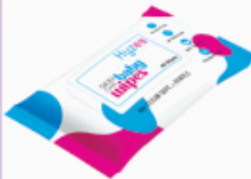
Baby Wipes 40 Pulls