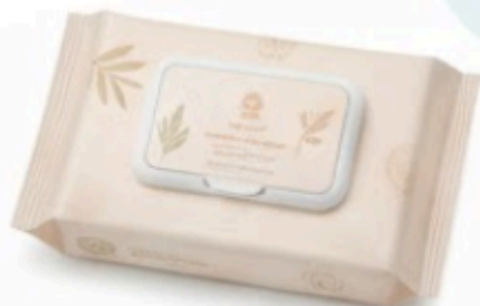
Face Wipes (gentle skin use)