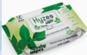
Neem Baby Wipes 80 Pulls