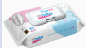
Baby Wipes 72 Pulls