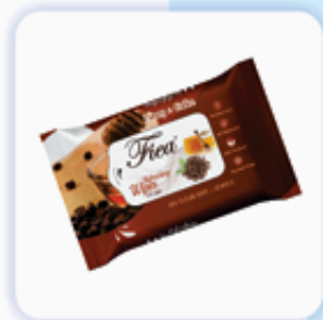
Refreshing Wipes 25 Pulls Honey & Coffee