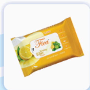
Refreshing Wipes 25 Pulls Lemon